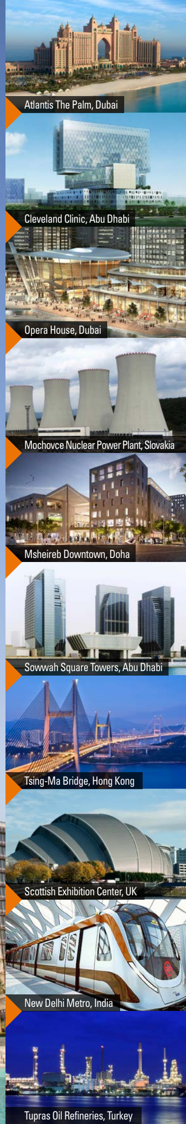
Atlantis The Palm, Dubai