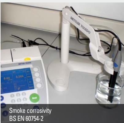
Smoke corrosivity BS EN 60754-2