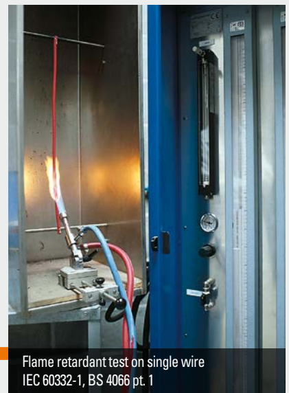
Flame retardant test on single wire IEC 60332-1, BS 4066 pt. 1