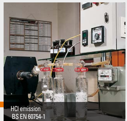
HCl emission BS EN 60754-1