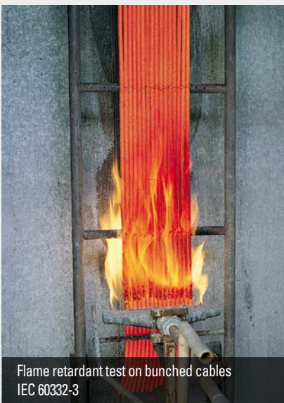
Flame retardant test on bunched cables IEC 60332-3