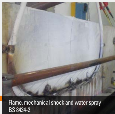
Flame, mechanical shock and water spray BS 8434-2