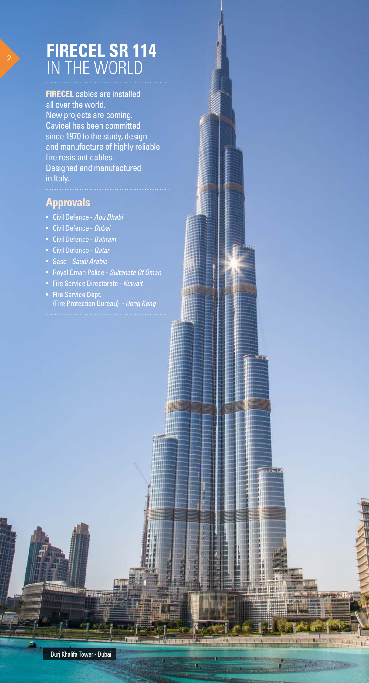
Burj Khalifa Tower - Dubai