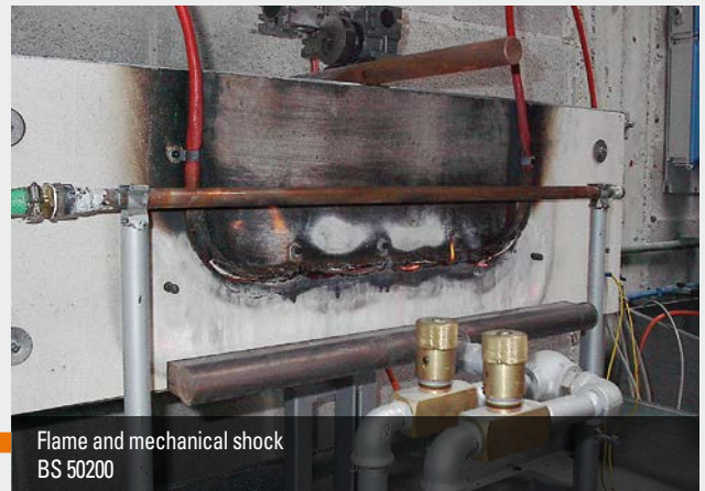
Flame and mechanical shock BS 50200