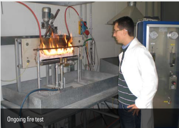
Ongoing fire test

FIRECEL CABLES ARE TESTED AND CERTIFIED BY THIRD-PARTY INSPECTION COMPANIES: LPCB-BRE AND BASEC . ANYWAY IN CAVICEL ALL TESTS RELATED TO FIRE ARE INHOUSE PERFORMED ON A REGULAR BASE, TO GET A VERY HIGH TRUST TO ASSURE CUSTOMERS THE COMPLETE SAFETY.